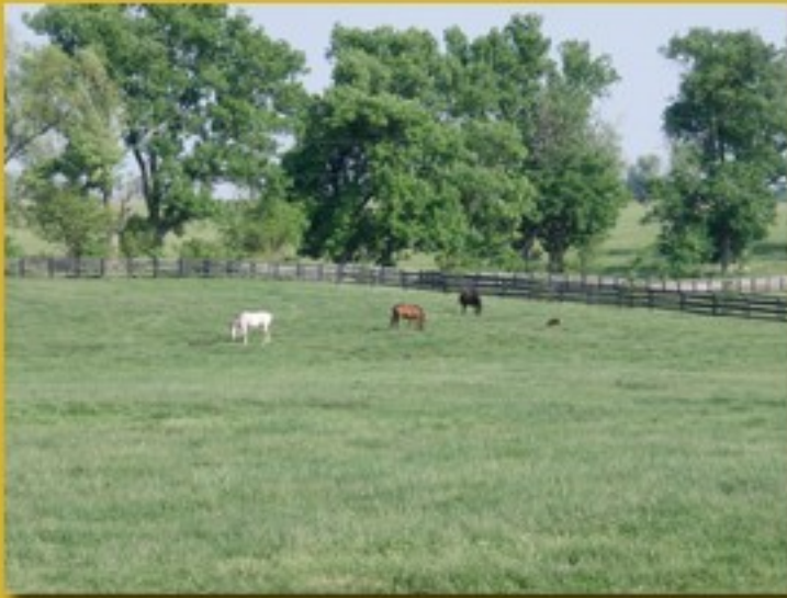
Cleveland Road Corridor