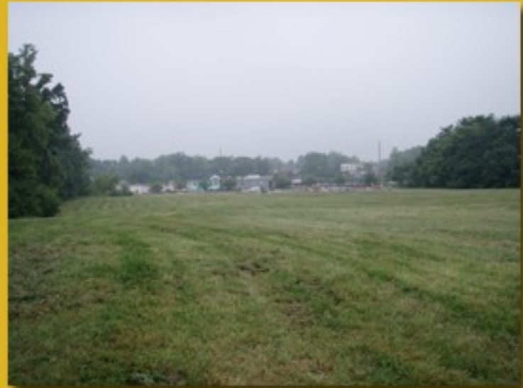
Site of Ellerslie Place