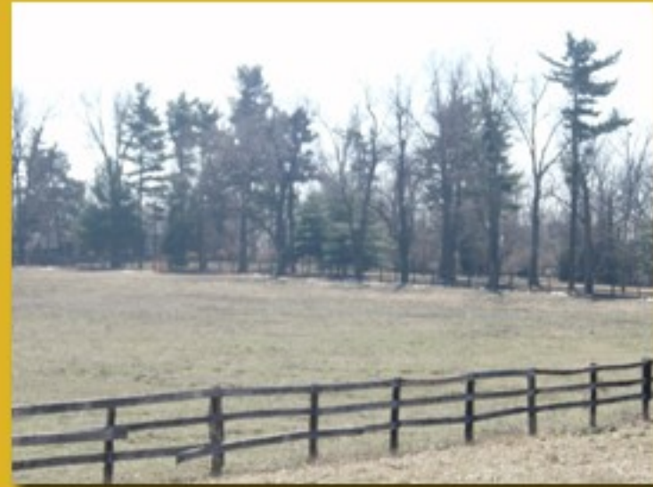
Site of Proposed Russell Cave Rd. Development