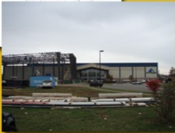
Worship Facility Expansion