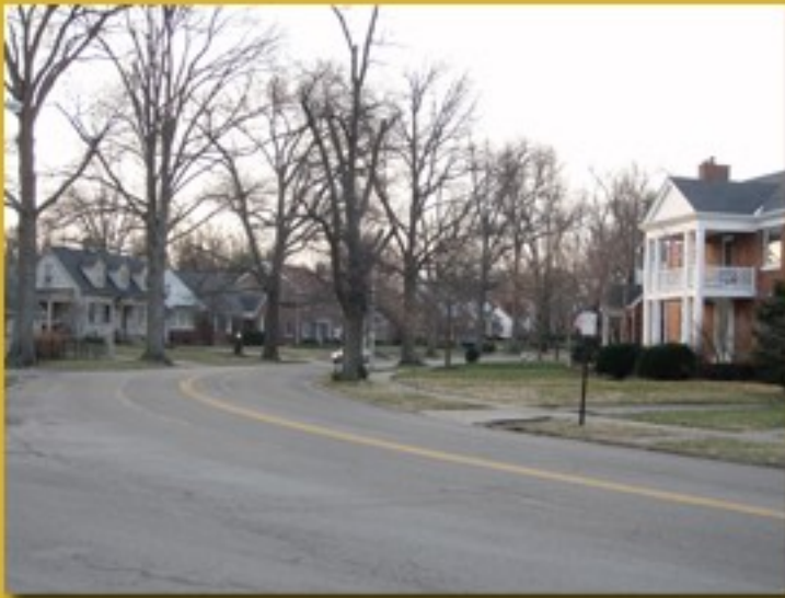
Chevy Chase ND-1 Area

For a complete list of Alliance initiatives, visit www.fayettealliance.com